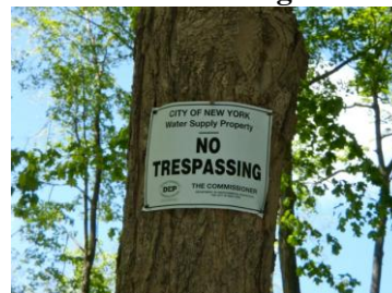
This watershed property is located within 30 feet of our landfill

If you have any questions, comments or suggestions please e-mail us at info@crse.org .